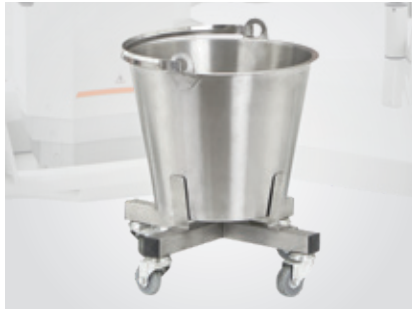
Stainless steel bowl with castors