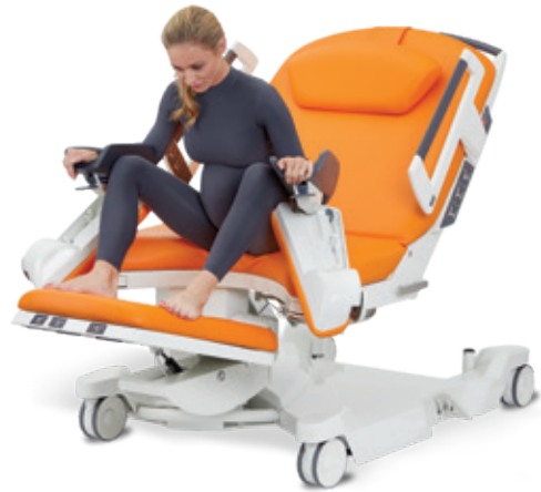
Half sitting using leg holders