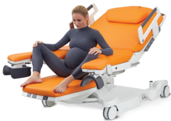
Half sitting using foot section