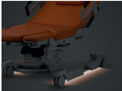
Under bed light