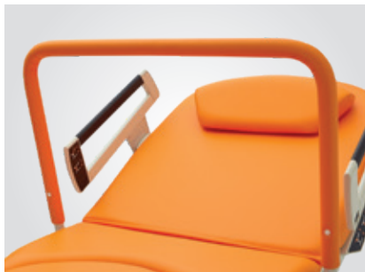
Supporting upholstered bar