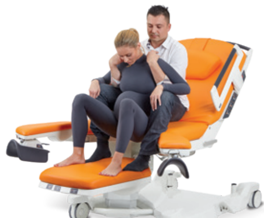
Half sitting with partner assistance