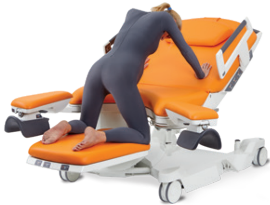
All fours position