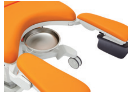
Sliding stainless catch basin 4.5l