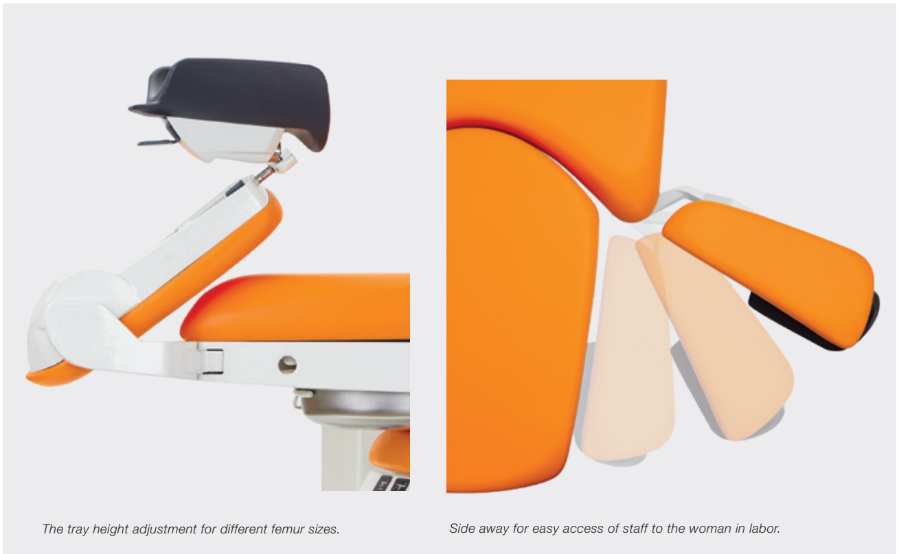
The tray height adjustment for different femur sizes.