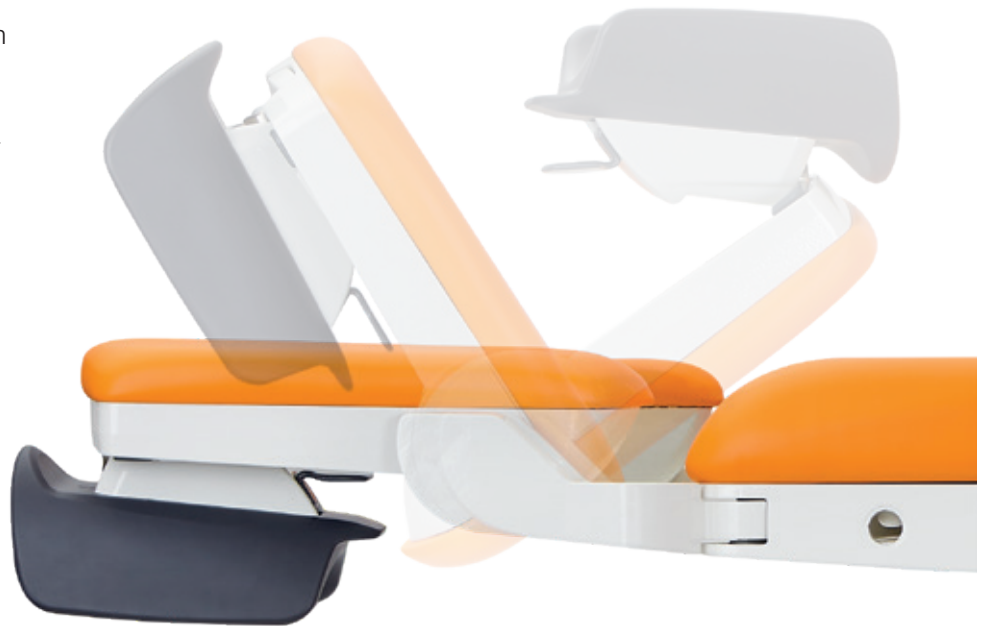
Quick adjustment of the leg rests into the required position.

The firm conception of leg rests enables the care team to respond very quickly and effectively to different situations which may occur during the delivery.