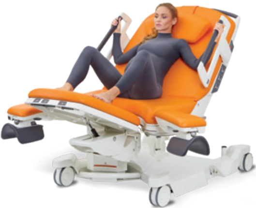
Semi recumbent position with the feet rested on the foot section