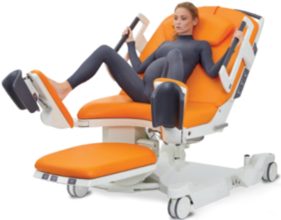
Semi recumbent position with the feet rested on the leg rests