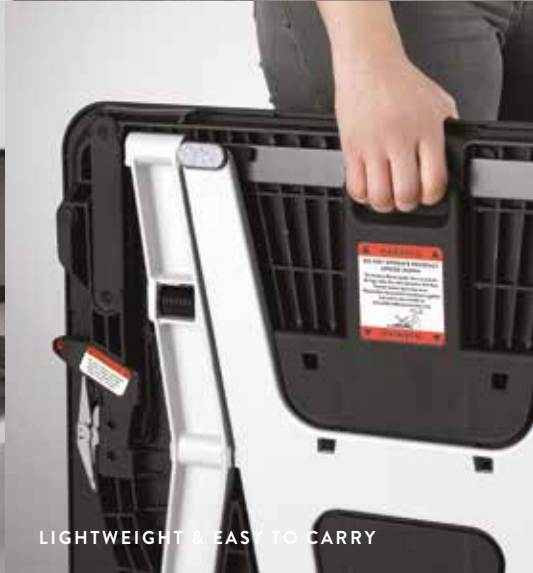
LIGHTWEIGHT & EASY TO CARRY