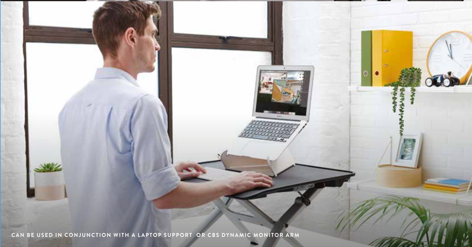
CAN BE USED IN CONJUNCTION WITH A LAPTOP SUPPORT OR CBS DYNAMIC MONITOR ARM