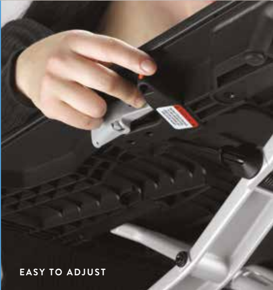
EASY TO ADJUST