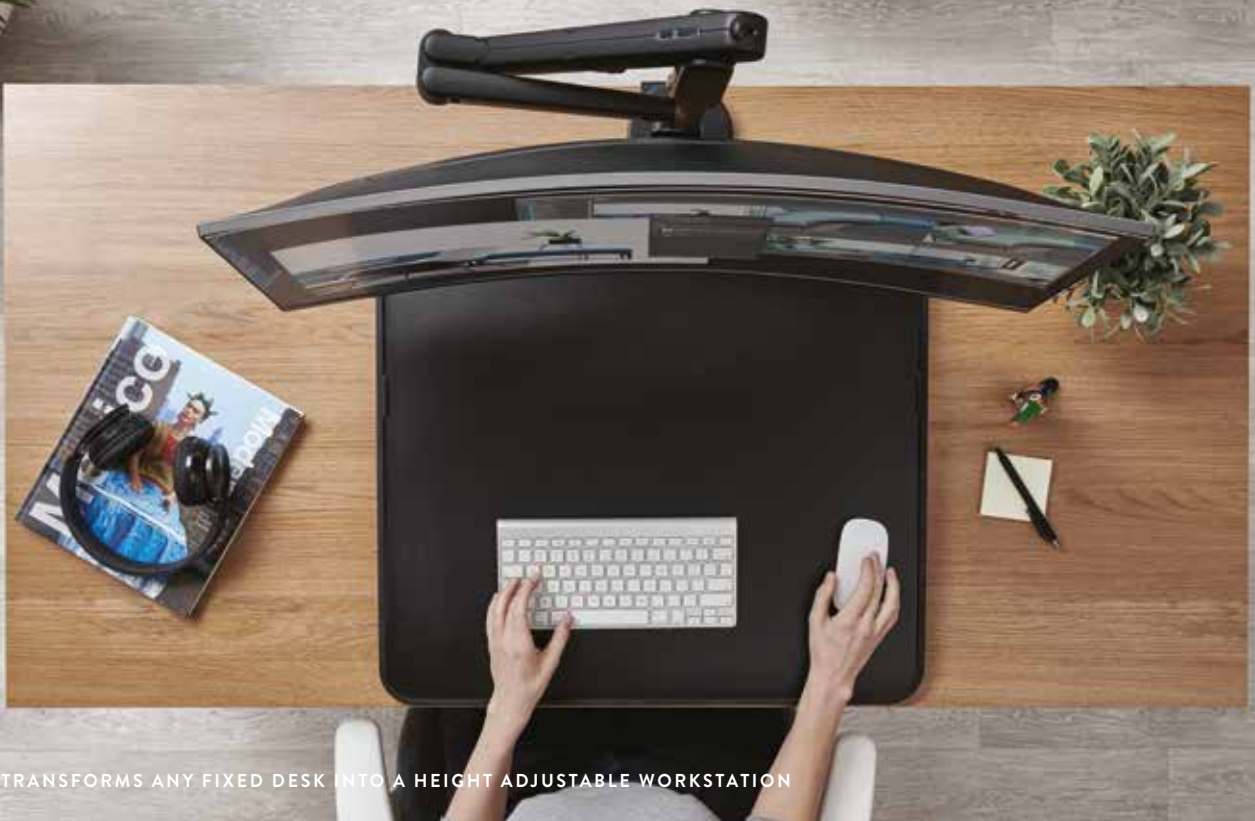
EFFORTLESSLY TRANSFORMS ANY FIXED DESK INTO A HEIGHT ADJUSTABLE WORKSTATION